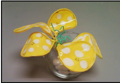
Pieces of art from our LIFESPAN Artists included flower votives (above) and wind chimes (right)

Amidst the dozens of other white tents on a beautifully sunny day in May, the LIFESPAN display burst forth with the colors of the season. The artists had been working on handmade flowers, wind chimes and paintings that reflected the blooms surrounding us in the mountains. Also blooming in the garden market of the Whole Bloomin' Thing Festival of the Historic Frog Level district was the popularity of LIFESPAN's growing arts program.