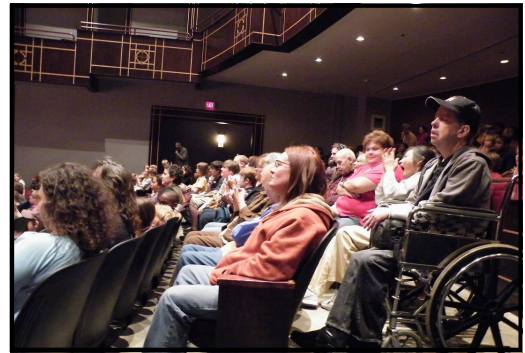
Our individuals at the Diana Wortham Theatre in Asheville