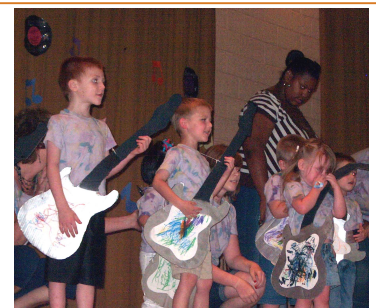
Circle School graduates performing

Children performed to "The Body Rock" and "Rock the Day Away". Eight students were celebrated for their accomplishment of transitioning from Preschool to Kindergarten, with presentations of certificates. Parents and family members joined the children in a cookout following the program.