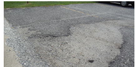
Funds raised through "Reflections of Tim" will be used to repair the damaged pavement around Creative Campus—Troutman

The evening also served to raise funds to pave the parking lots and street at Creative Campus in Troutman. This is now a priority due to the many safety issues for families driving and parking, as well as individuals using wheelchairs and walkers. The drive is very old and has multiple pot holes in the pavement (see picture representing one of many). The estimated cost for paving is just over $30,000. Tim's event raised $5,000, so we are 1/6 th of the way there!